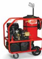
Model 1075BE 4.0 GPM @ 3500 PSI; GX390 Honda gas engine (shown with optional caster kit)

What's the best detergent for your next job? Find out with our solution selector. Scan this QR code or visit HOTSY.com