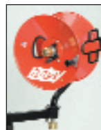
360° Pivot and non-pivot hose reels keep hose neatly stored and shop areas safe