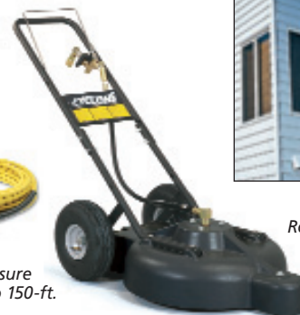
Rotary surface cleaner attaches to your pressure washer; reduces overspray and zebra striping