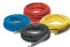
Heavy-duty, high-pressure hoses in lengths up to 150-ft.