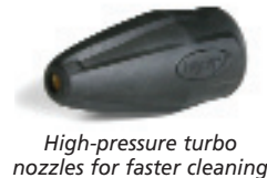
High-pressure turbo nozzles for faster cleaning

Telescoping wands extend to 24' to reach high places without scaffolding